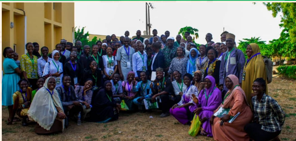
Cross section of participants at the Conference