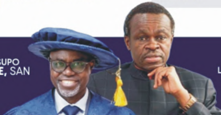
PROFESSOR PATRICK LOCH OTIENO LUMUMBA GUEST SPEAKER