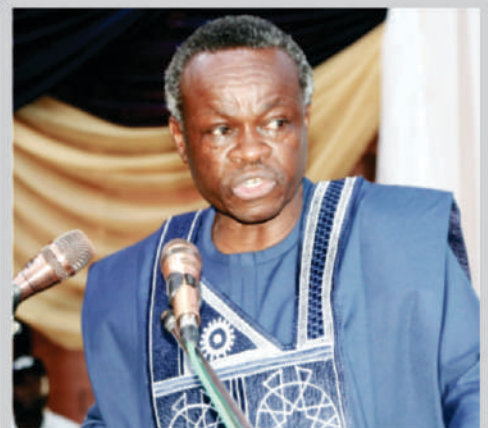
Lumumba tasks Nigeria on African renaissance ---Page 2

See stories and photographs on pages 2, 3, 4, 5, 6, 7, 8, 9, 10, 11, 12, 13, 14, 15, 16, 17, 18, 19 and back page