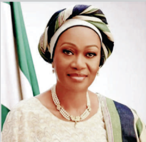
First Lady, Oluremi Tinubu, Lauds Unilorin's Legacy of Excellence— Page 4

For four events-packed days last week (Monday, 24 th – Thursday, 27 th November, 2025), the University of Ilorin went abuzz, as dignitaries from all walks of life turned the Better by far campus to a Mecca of sort, all for the 50 th anniversary celebration of the University.