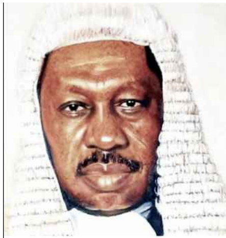
■ Late Justice Uwais

Secretary-General of the Association of West African Universities (AWAU), said that the tenure of the late Justice Uwais as the Chief Justice of Nigeria would continue to be celebrated for so many positive developments, which deepened the nation's jurisprudence.