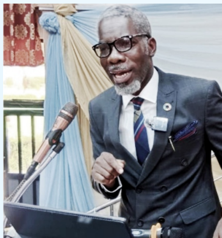
■ Mr Olarinde,

He also highlighted the National Tax Policy, which emphasises environmental taxation and promotes fiscal measures aligned with sustainable