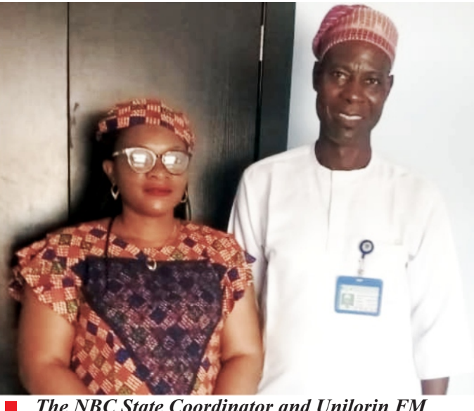
The NBC State Coordinator and Unilorin FM Station Manager

the importance of peace and security, citing the example of the 1994 Rwandan genocide, which was exacerbated by irresponsible broadcasting.