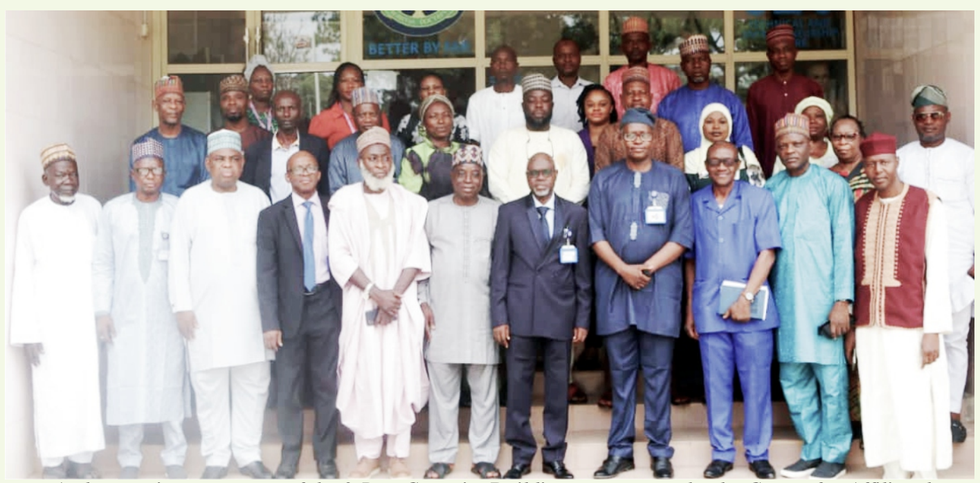
At the opening ceremony of the 3-Day Capacity Building programme by the Centre for Affiliated Institutions for affiliated institutions to University of Ilorin, Nigeria