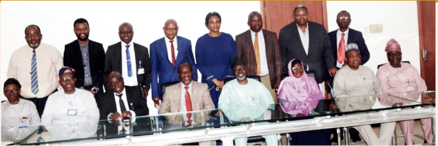
The Vice Chancellor and members of his management team with the NMA team after the meeting last Tuesday