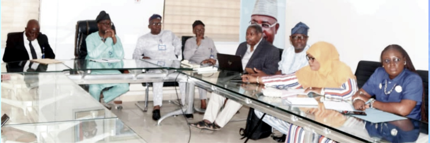
■ The VC at the meeting with Golden Jubilee Anniversary Committee.