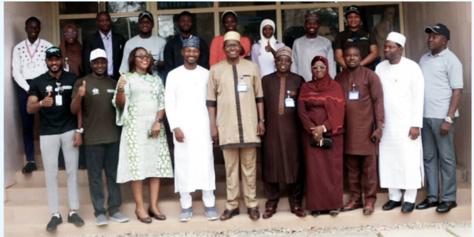
Dignitaries and participants at the NELFUND Sensitisation Programme