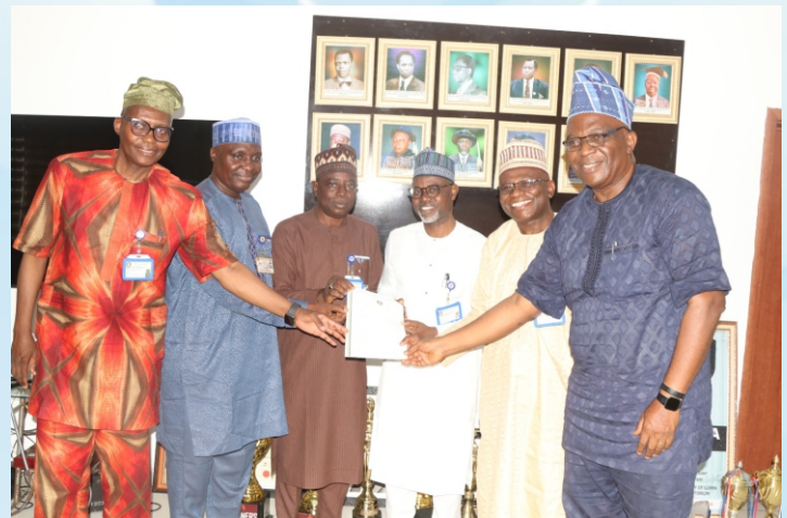
■ The Vice Chancellor (3rd right) with Principal Officers after receiving the commendation letter

The Vice Chancellor further stated that he would forever cherish the honour, saying, "I am extremely moved and at a loss for words. I will cherish this always and tell my family about the honour bestowed upon me by my colleagues."