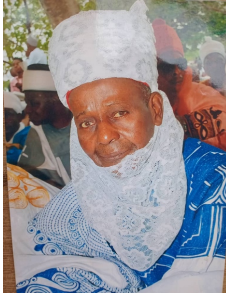
■ Alhaji Atiku

The Balogun Fulani said that the donated crocodile, which is approximately 25 years old, will be a remarkable addition to the growing animal collection of the