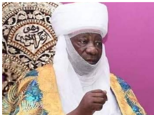
■ Emir of Ilorin

The Vice Chancellor, who is also the Secretary-General of the Association of