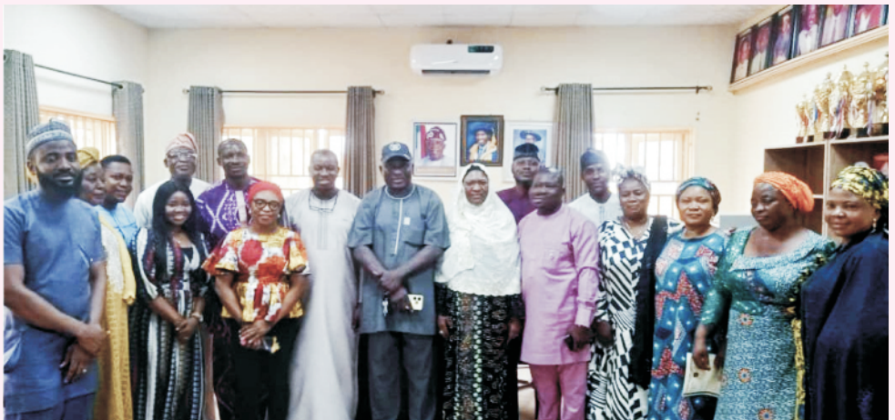
■ The honourees and some staff members of the Unit at the

honourees to maintain the culture of hard work, urged them to remain good friends of the Unit.