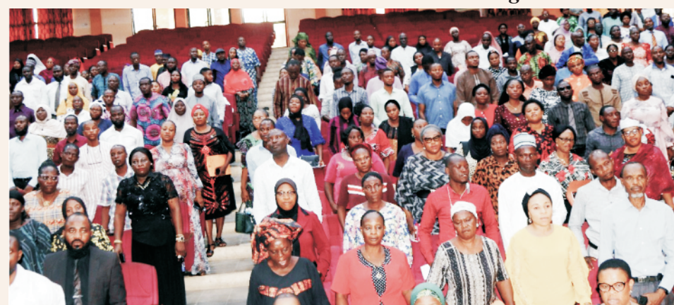
A cross section of participants at the Seminar last Wednesday