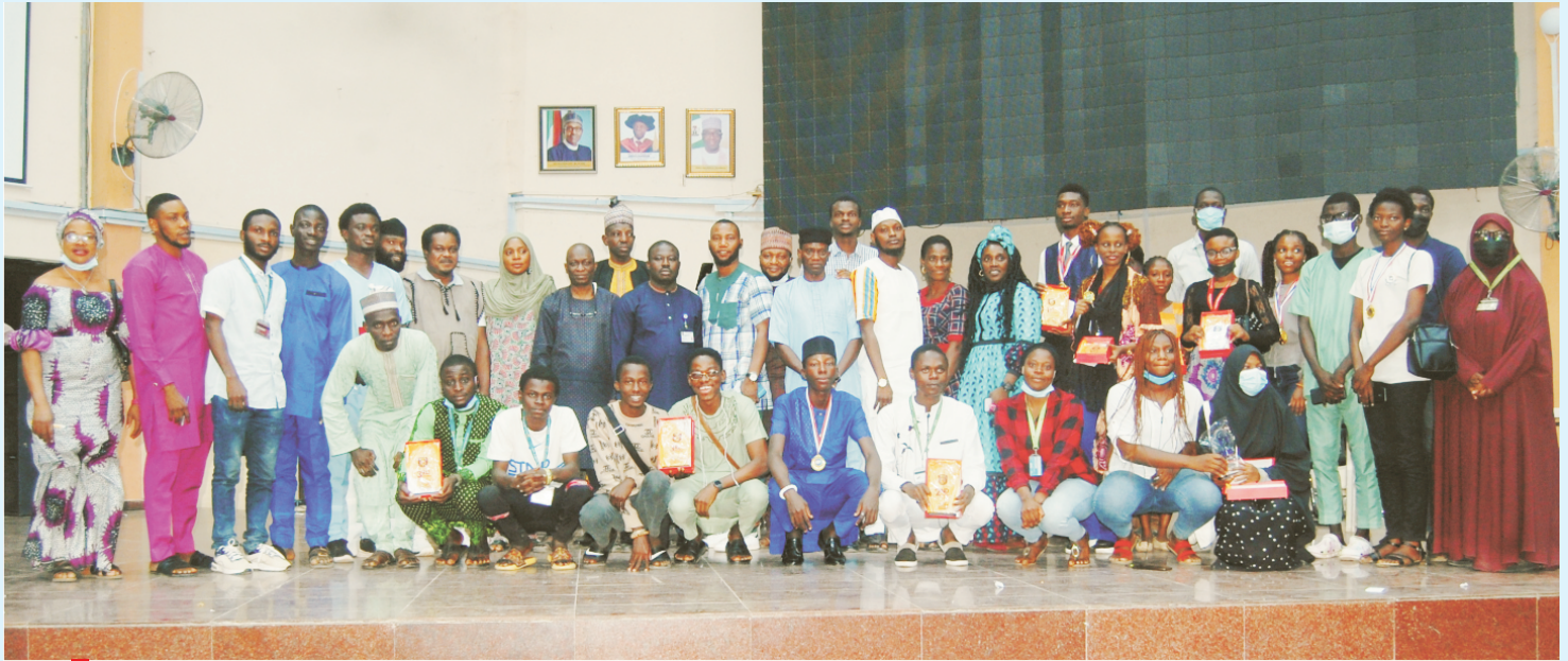
Cross section of officials and participants at the Inter-Faculty Quiz and Debate Competition