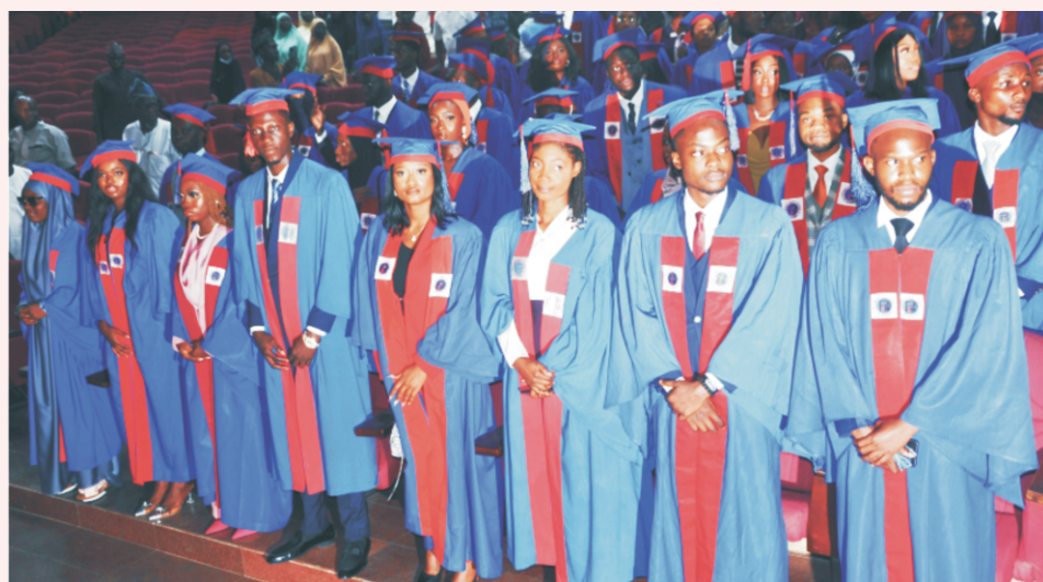
■ Cross section of the new pharmacy graduands during their induction ceremony