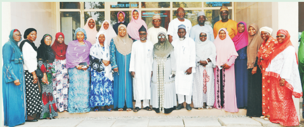
■ The honourees and dignitaries at the event