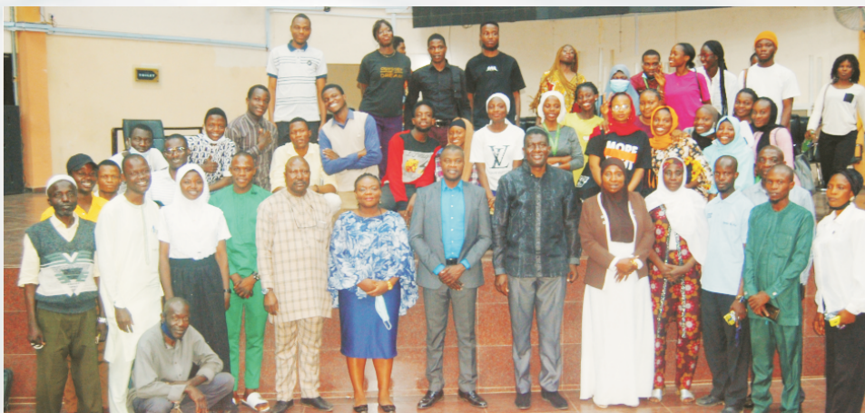
Cross section of officials and participants at the workshop