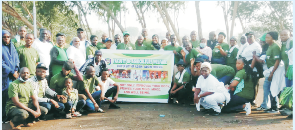
■ Cross section of the participants after the walk

The Dean appreciated the Principal Officers for the support and encouragement, including their involvement in the walk, adding that the programme should be held