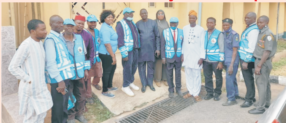
■ The Special Marshals with officials of the Corporate Affairs Directorate during the sensitisation visit