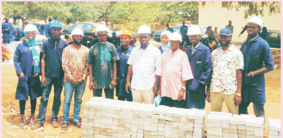
■ Some SWEP students and their technologist lecturers showcasing the interlock produced by the students for the road construction