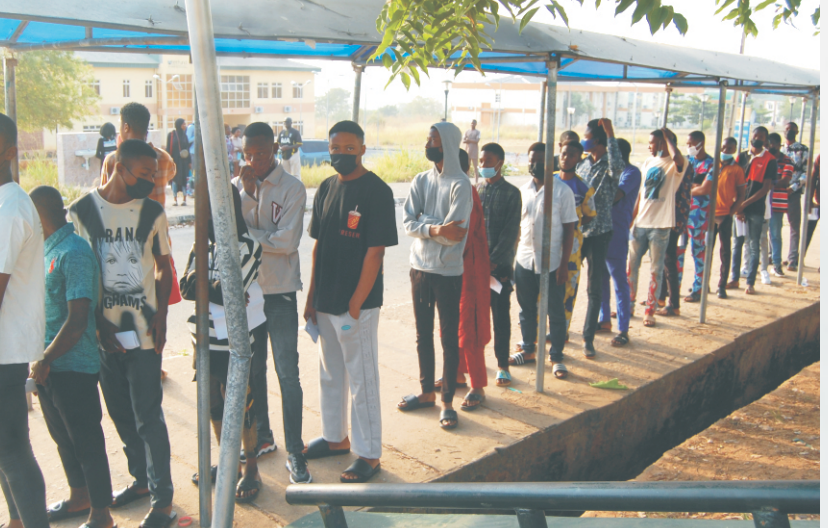
A cross section of candidates filing into the CBT hall

Of the 28, 048 candidates that scored 180 and above in this year's Joint Admissions and Matriculation Board (JAMB) examination and made the University of Ilorin their first choice, 18,639 registered to participate in the pre-admission screening exercise, while 18,153 actually sat for the post-UTME test. (Contd. on page 4)