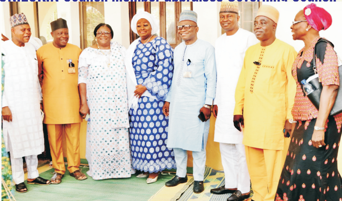
■ The celebrant (middle) flanked by other Council members at the event

Some of her colleagues on the University Governing Council were at