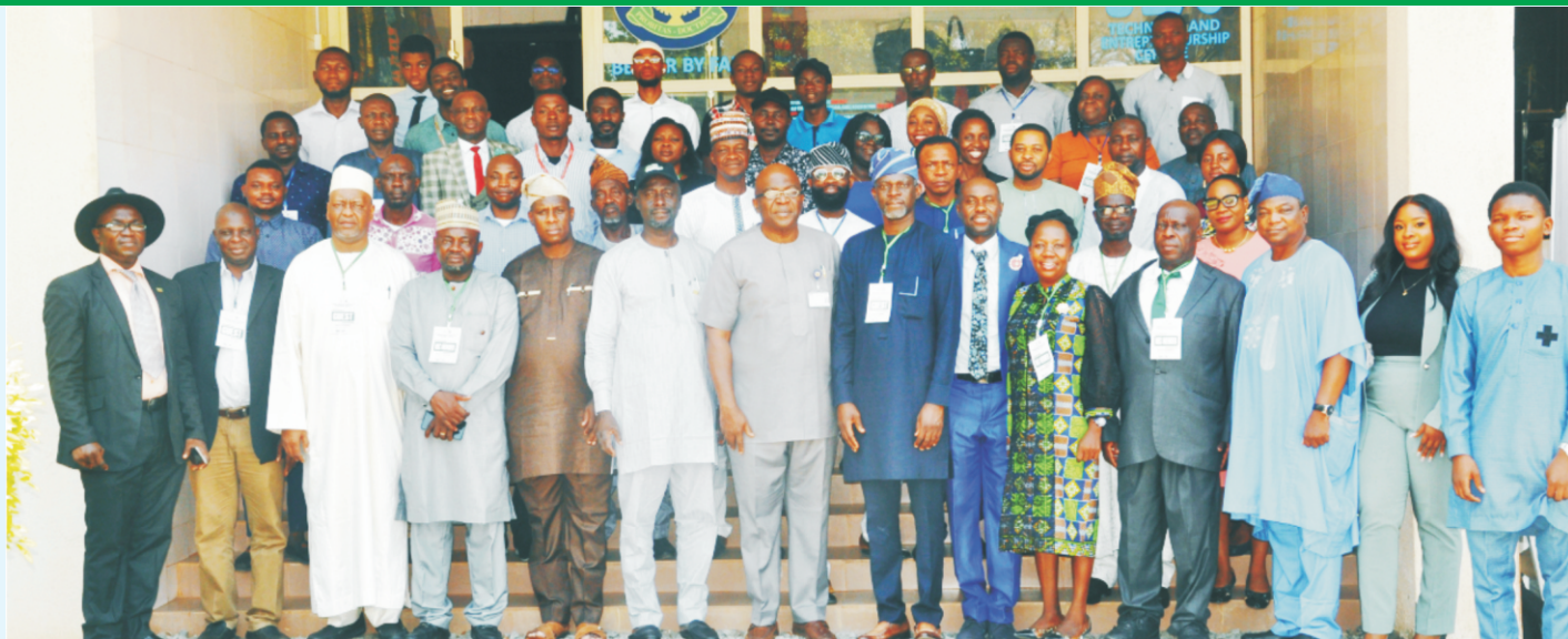
■ Dignitaries and participants at the NITPCS Symposium last Wednesday