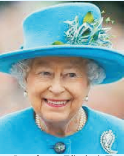
Late Queen Elizabeth II

over "the smooth transition of the crown within the monarchy" and pledged its loyalty and support to the new King Charles III.