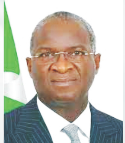
■ Mr. Raji Fashola, Minister of Works