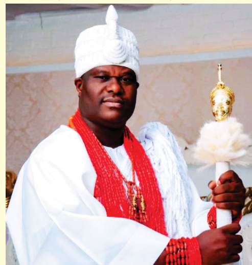
■ Oba Ogunwusi

The Royal Father told the Ife-born don, “Your latest status is a true reflection of your decades of investment in the growth of Nigeria’s Education sector through the University of Ilorin. I am so proud and I