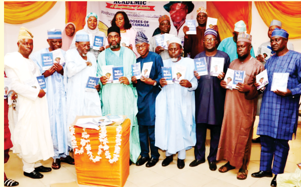
■ Guests displaying the books