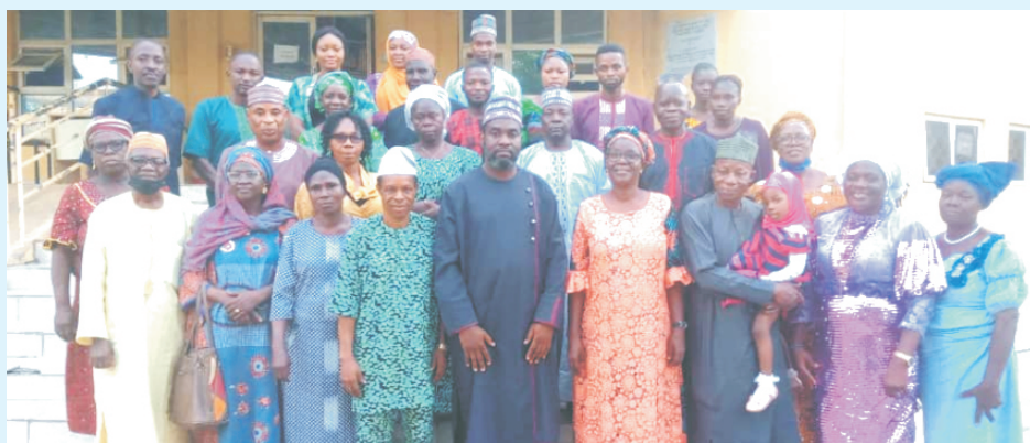
■ Cross section of the honourees with the Director (4th from right) and members of staff of CPSS after the event

While appreciating the honour, the Registrar said, "Permit me to also rejoice