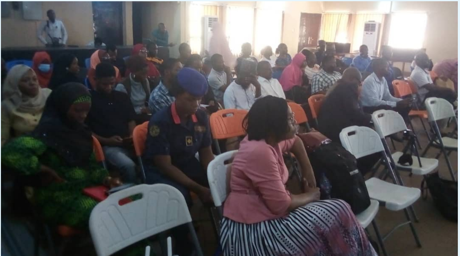
■ Cross section of participants at a workshop on Data Science organised by the Carnegie Foundation for lecturers at the Centre for Open and Distance Learning, University of Ilorin, last Tuesday

The curriculum content, published by the Department of Curriculum Studies, Universitas Negeri Semarang Indonesia and when pitched against other innovations from co-contestants won the best solution to solving climate issues in Ilorin West local government.