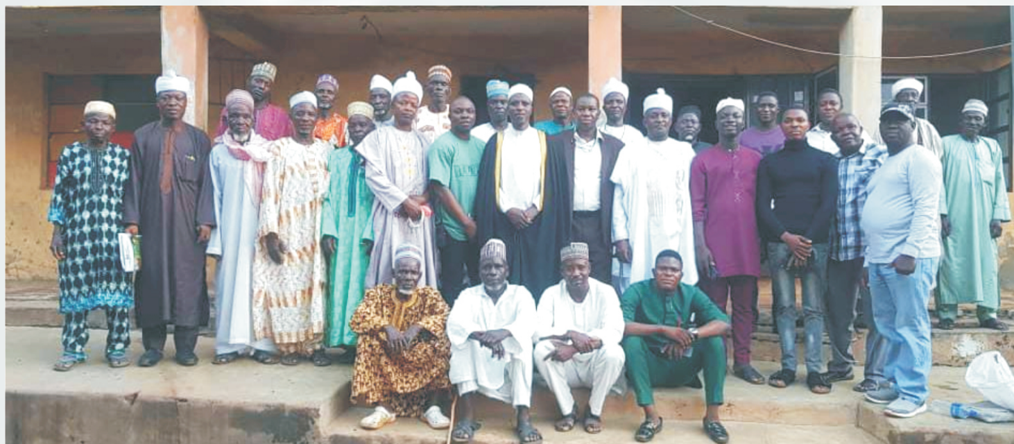
■ A cross section of the participants at the meeting