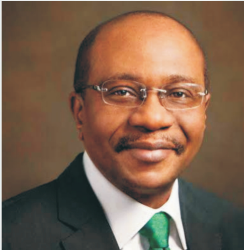
■ CBN Governor Emefiele

The Central Bank Governor, Mr. Godwin Emefiele, will this Thursday (July 21, 2022) perform the official commissioning of the multimillion naira UNILORIN GgMAX Integrated Poultry Farm located at Amoyo in Ifelodun Local Government Area of Kwara State.