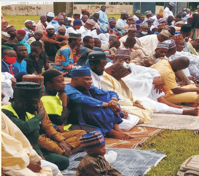
■ A cross section of Muslim faithful at the UNILORIN Eid Praying Ground last Saturday

The Vice-Chancellor wished Muslims and other members of the University community very fruitful Sallah festivities.