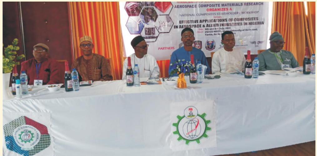
■ A cross section of dignitaries at the Workshop

While declaring the event open, the Permanent Secretary of the Federal Ministry of Science, Technology and Innovation, Mrs