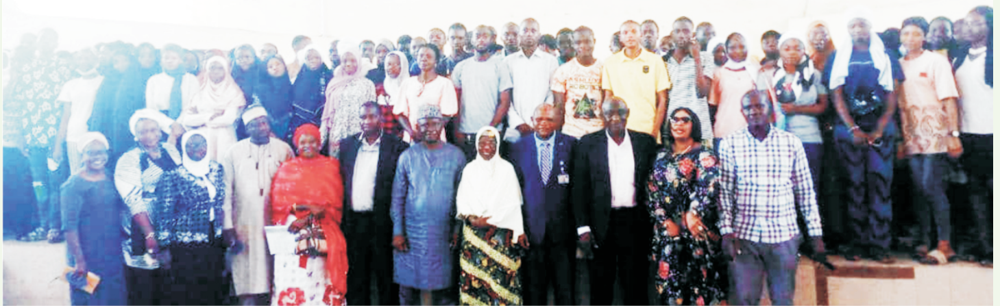
■ Cross section of dignitaries and the students during the orientation program