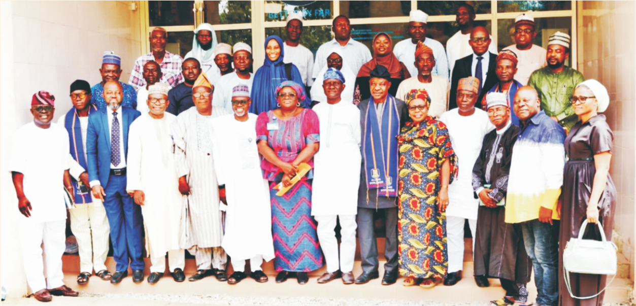
■ Members of the UNILORIN Alumni Association shortly after the meeting with the Vice Chancellor last Friday