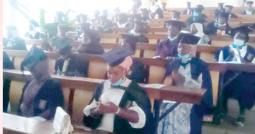
■ A cross section of the new TRCN inductees