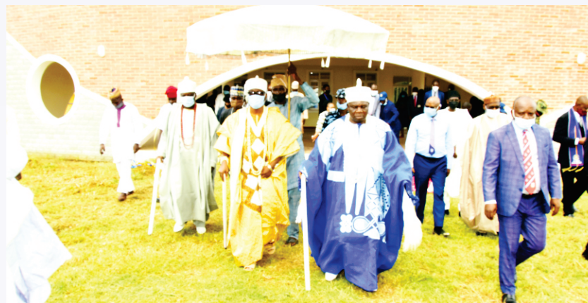
■ Some of the traditional rulers at the Convocation Ceremony