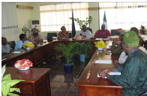
Members of Unilorin Governing Council at their meeting last Wednesday