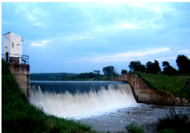
NATURE PLUS TECHNOLOGY: Unilorin Multipurpose Dam

Typologically, gravity dams, embankment dams, arch dams and buttress dams, among others, are identifiable as various forms of dam that human beings have constructed and are still constructing.