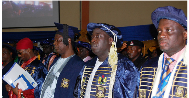
L-R: The Chancellor, the Deputy Governor of Kwara State, the Minister and the Vice-Chancellor

The Vice-Chancellor also highlighted the activities of the University in the year, contained in the Annual Report he presented to the Visitor. “For example, we have upgraded teaching facilities, assured quality in our examinations, maintained 100% full accreditation of the University programmes, awarded scholarships to 96 outstanding students, encouraged staff and student exchange with our international partners, sponsored or facilitated the sponsorship of 470 staff to conferences and workshops, increased staff-student-ratio, attracted staff talents from almost all the states of the Federation and 17 world countries, promoted a good number of qualified staff, re- invigorated research with training and funding, hosted and organised scores of conferences, workshops and seminars, forged further collaborations, enhanced academic publications qualitatively and quantitatively, upgraded our botanical garden with additional animals for research and leisure, invested in fitness programmes, further landscaped and greened the campus...,” he said.