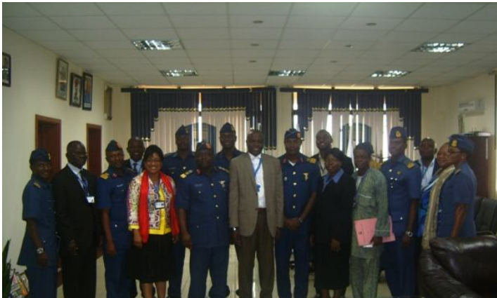
ATTENTION: The Air Force delegation with the University of Ilorin team in a group photograph