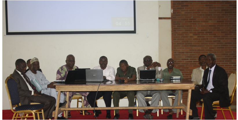
EGG-HEADS: Deans of Faculties before their presentations