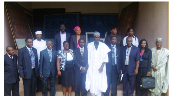
SHOULDER TO SHOULDER: A group photograph of dignitaries after the opening ceremony