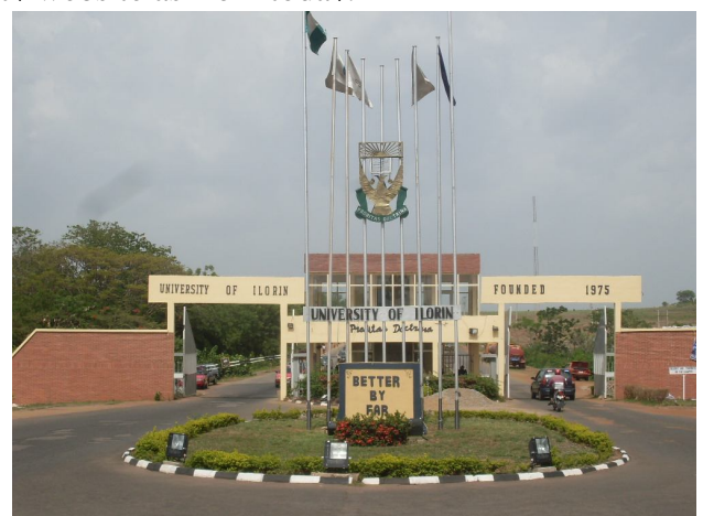
UNILORIN: Scaling the Heights

“The deadline for the uploading of required information is 6th August 2011. However, candidates awaiting any result but who have registered before 6 th August 2011 have the opportunity to upload their results on/or before 15 th August, 2011 when the Portal will close.” (Contd. on page 4)