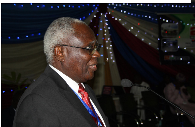
Prof. Akin Mabogunje addressing the Unilorin-UCC conference participants as chairman of the opening ceremony a fortnight ago