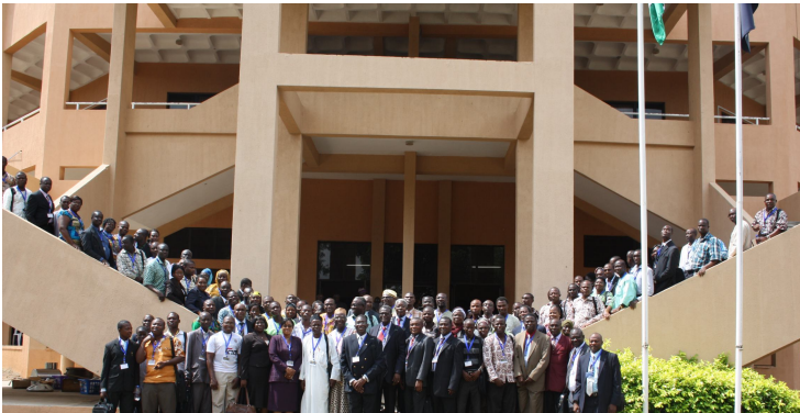
WE ARE ONE: Participants in a group photograph during the conference